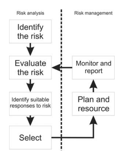
Figure 5.1Risk Management Cycle